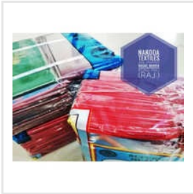
Polyester Terry Rubia Blouse Material