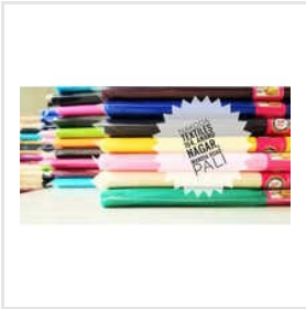
Cotton Lining Fabric