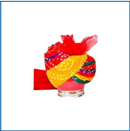
RAJASTHANI TURBAN CLOTH