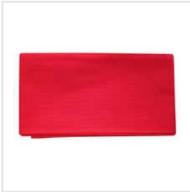
4 Inch Heavy Cotton Rubia Saree Fall