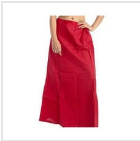
Ladies Saree Petticoat