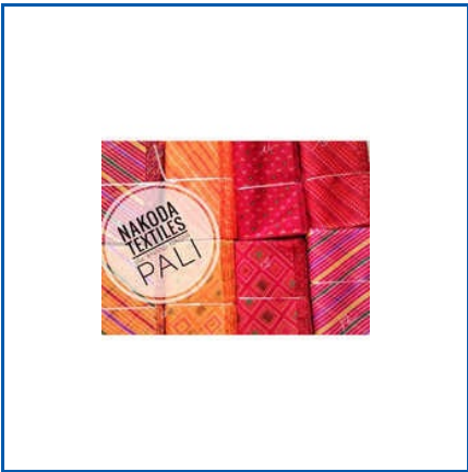
MENS TURBAN FABRIC

4 Inch Heavy Cotton Rubia Saree Fall, Cambric Cotton Fabric, Cotton Lining Fabric, Cotton Saree Fall, Dyed Roto Fabric, Fast Colour Full Voile Turban Cloth, Flower Print Safa Fabric, Flower Print Turban, Gold Print Turban Fabric, Ladies Saree Petticoat, Mens Fancy Turban, Mens Turban Fabric, Plain Cotton Fabric, Plain Khadi Fabric, Plain Lining Fabric, etc.