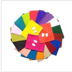
Cotton Saree Fall