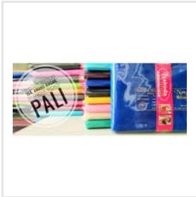
Terry Rubia Lining Fabric