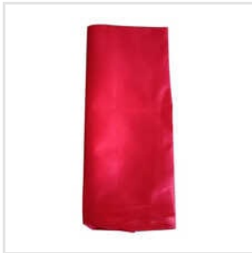
Dyed Roto Fabric