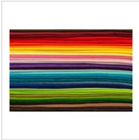
Polyester Blouse Material