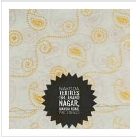
Gold Print Turban Fabric