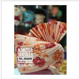
Flower Print Safa Fabric