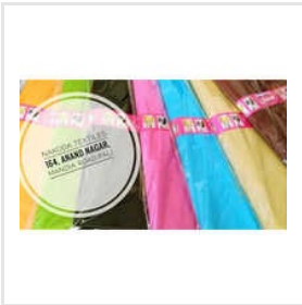
Plain Lining Fabric