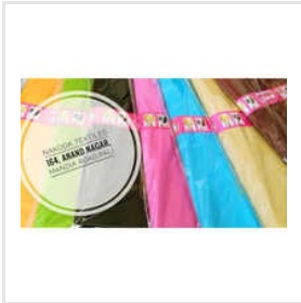
Polyester Lining Fabric