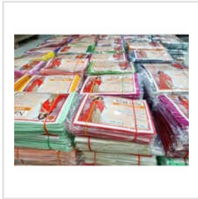
Cotton Saree Fall