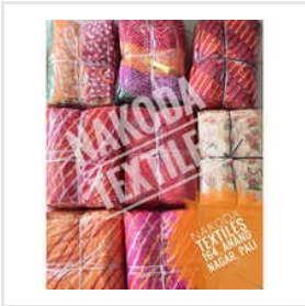
Polyester Turban Fabric