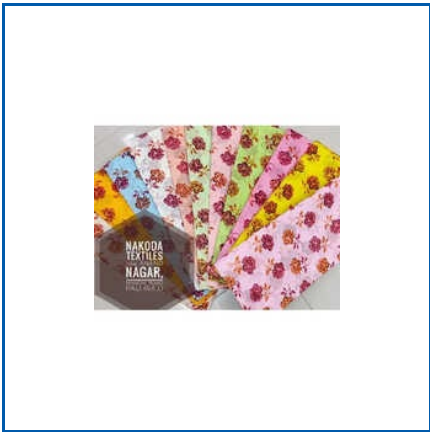
PRINTED TURBAN FABRIC